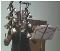
Autumn Bell Tree Solo