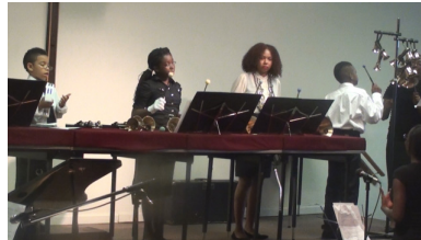
Jubilee Ringers - Ringing Jazzy Praise

You Are Invited To Our Annual Christmas Concert & Buffet